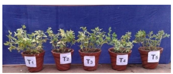
Figure- 4, In vitro experiment on groundnut plant growth

T1-30% feather compost, T2-20% feather compost T3-10% feather compost, T4-5% feather compost T5-control