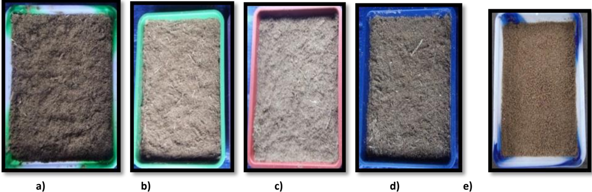
Fig-1: Feather Decomposition Moisture 30 to 40%, 10 ml culture inoculated, sterilized sand and sterilized feather used.

a) Sand+feather 5% + Strain-FDS1510% b) Sand+feather10%+ Strain-FDS15 10% c) Sand+feather20%+ Strain-FDS15 10% d) Sand+feather30%+ Strain-FDS15 10%